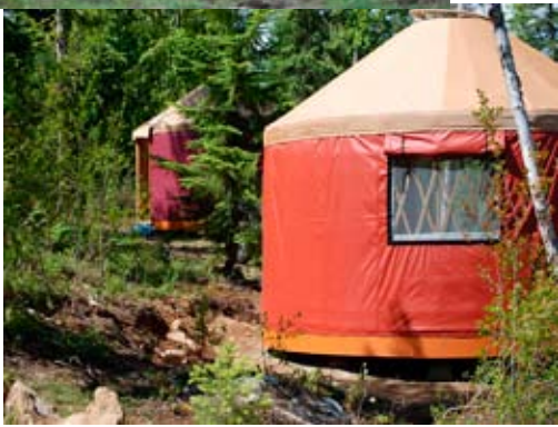
Spirit Vision Retreat Center