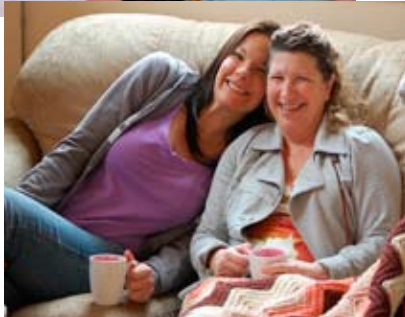
Spiritual Vision Questers use art, puppeteering and partnering to uncover hidden truths and saboteurs.